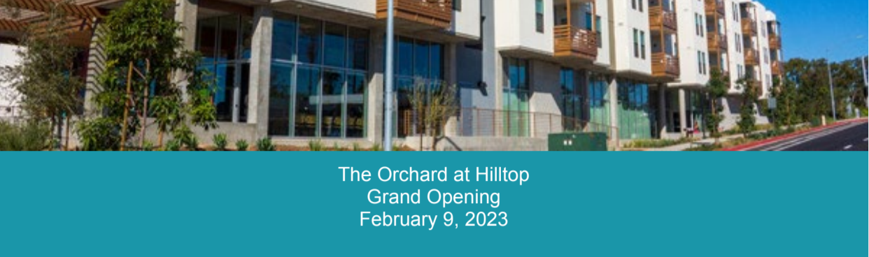
The Orchard at Hilltop Grand Opening February 9, 2023

I invite you to read more about SDHC's recent activities below.