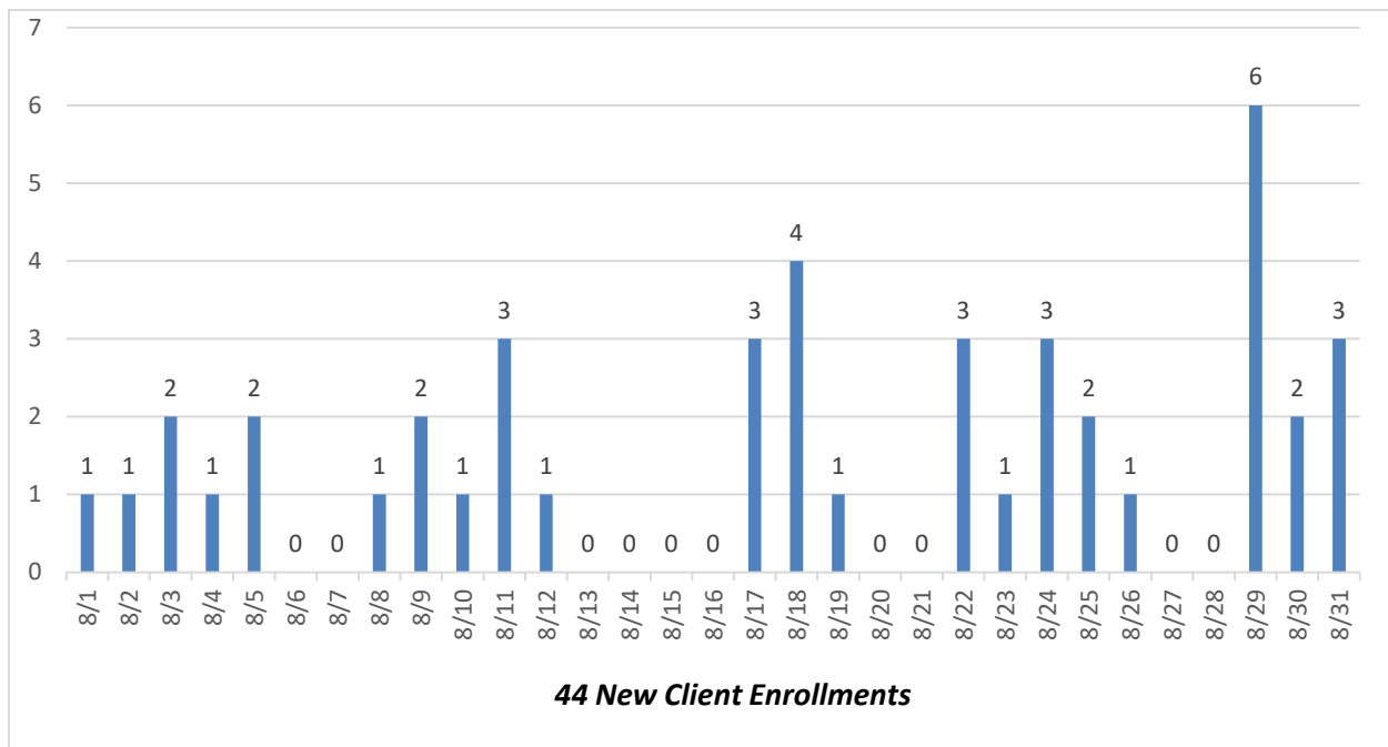
Table One: New Client Enrollments August 2022

The Center enrolled 44 new clients and served 528 total clients throughout August. Of the 528 clients served in August, 441 of them returned to the Center to access their personal belongings in their assigned storage bin. The total number of return check-ins was 1,924. Seventy-two clients exited the Center in August.