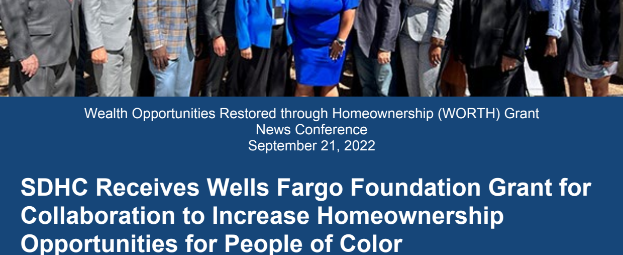
An expanded, collaborative effort to help more people of color in the San Diego region become homeowners was announced at a news conference about a $7.5 million grant SDHC has been awarded from the Wells Fargo Foundation.