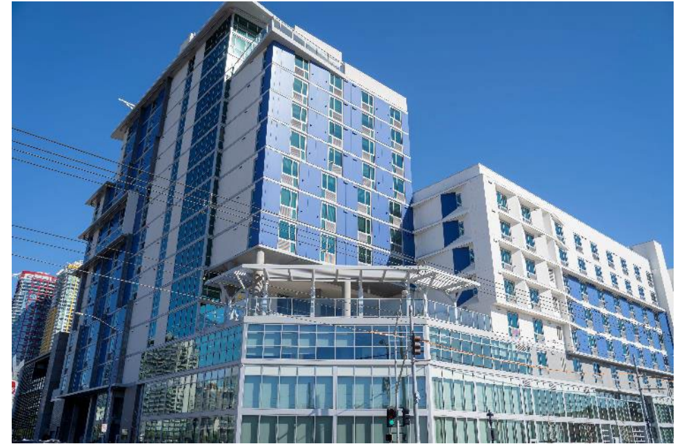
Saint Teresa of Calcutta Villa Apartments 403 affordable rental housing units, of which 270 are for people who experienced homelessness SDHC awarded 270 rental housing vouchers and $11.5 million loan. SDHC authorized $115 million in Multifamily Housing Revenue Bonds. Grand Opening: February 10, 2022