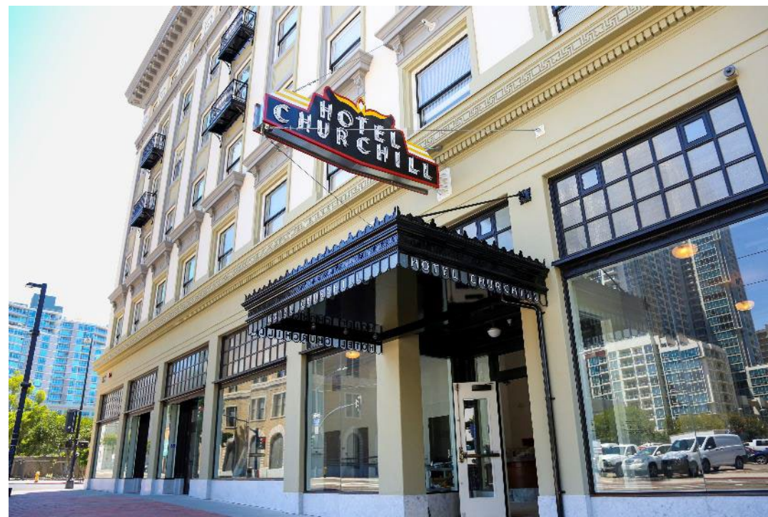
Hotel Churchill 56 units for veterans 8 units for transition-age youth (TAY) 8 units for adults exiting the corrections system