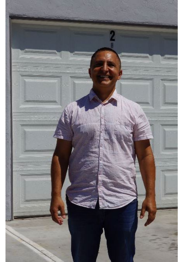
Section 8 Housing Choice Voucher Program Landlord Joe