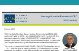
Previous SDHC Email Updates