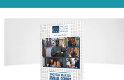
SDHC Annual Reports