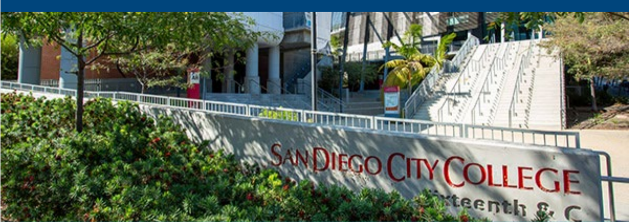
Homelessness Program for Engaged Educational Resources (PEER) SDHC and San Diego City College Inside California Education Broadcast