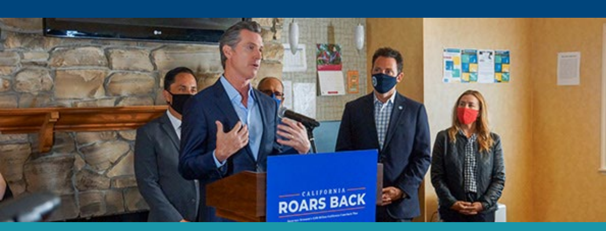
California Governor Gavin Newsom News Conference SDHC-Owned Kearny Vista Apartments May 11, 2021