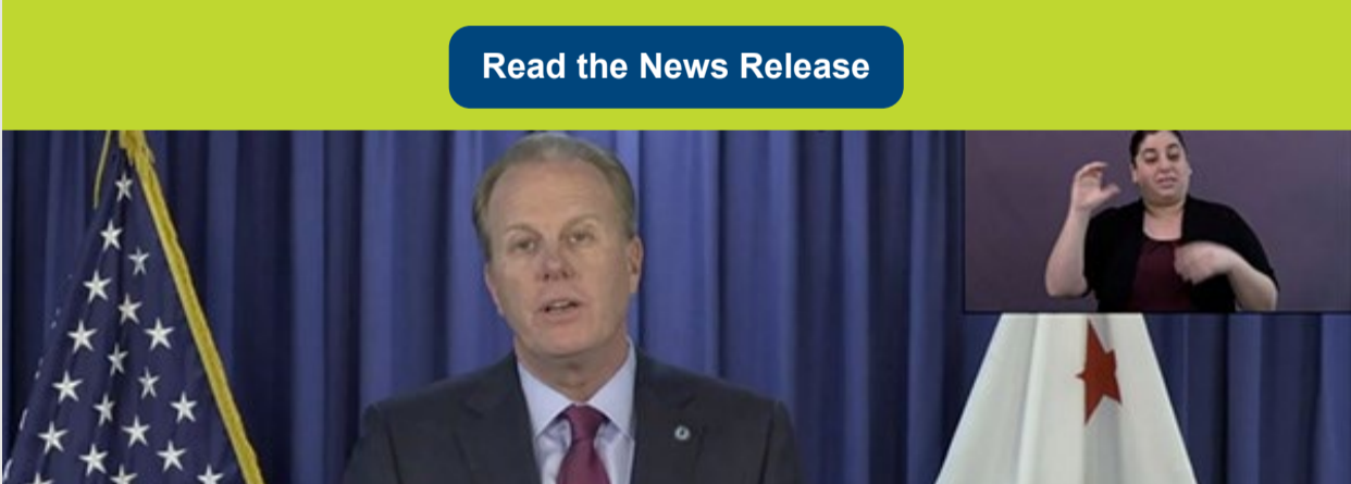
San Diego Mayor Kevin L. Faulconer Daily COVID-19 News Media Briefing April 21, 2020