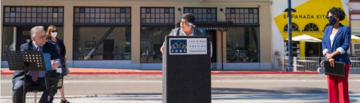
"Preserving Affordable Housing in the City of San Diego" News Conference May 28, 2020