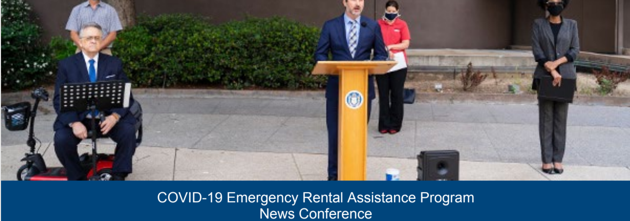
COVID-19 Emergency Rental Assistance Program News Conference June 2, 2020

I invite you to read more below about these and additional recent SDHC activities.