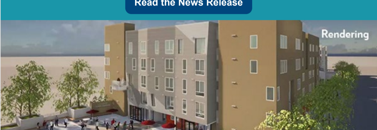
Mid-City Family and Senior Apartments Virtual Groundbreaking June 10, 2020