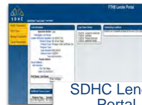
SDHC Lender Portal