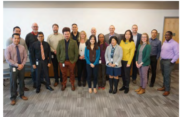
SDHC Pilot Mentoring Program February 2, 2019