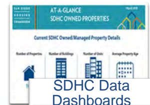
SDHC Data Dashboards