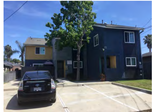
3081-83 Hawthorn Street