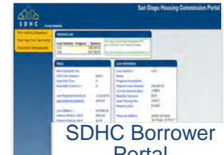
SDHC Borrower Portal