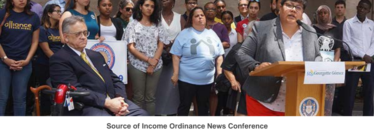
Source of Income Ordinance News Conference July 31, 2018