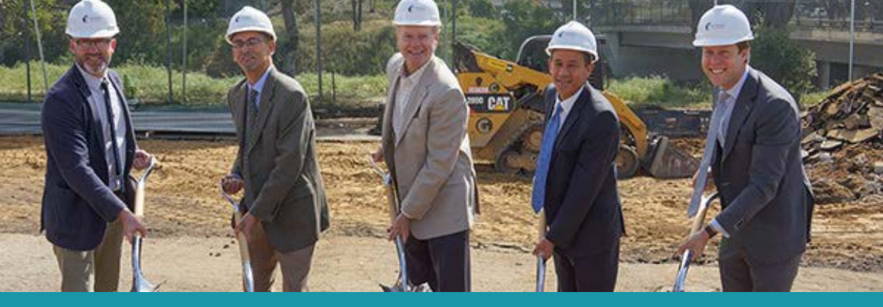
The Link Groundbreaking April 12, 2019