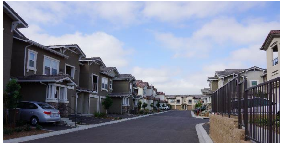
Cielo Carmel – Del Mar Heights 195 Affordable Units (Choice Community)