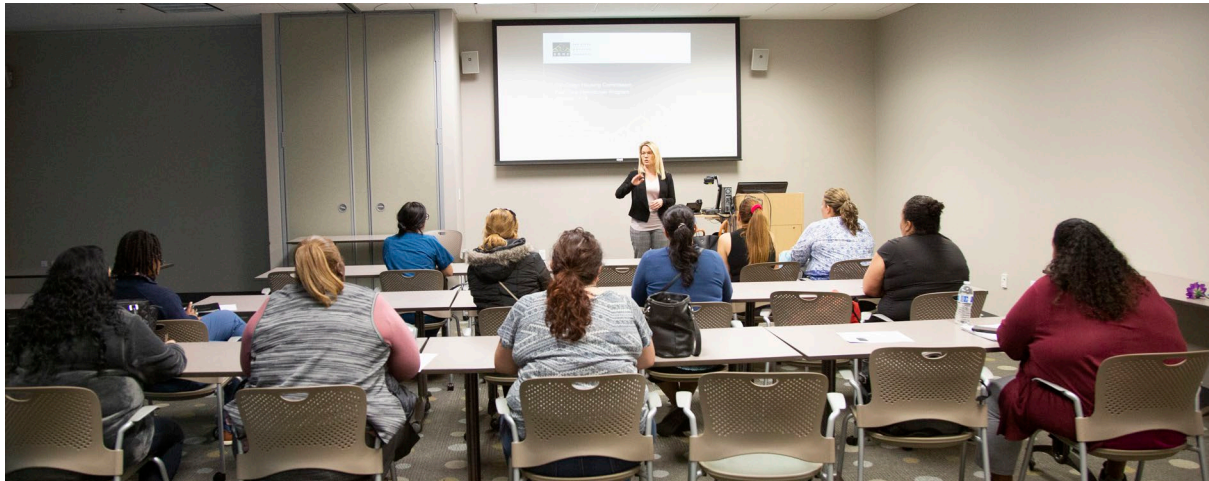
First-Time Homebuyer Program Workshop – March 7, 2019