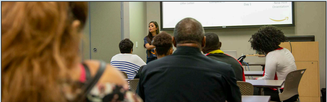
SDHC Achievement Academy Amazon Recruitment – 8.21.19