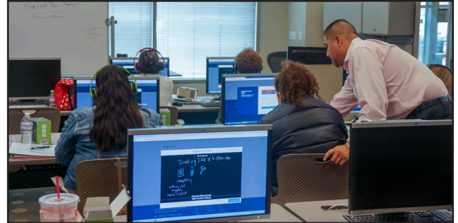
The SDHC Achievement Academy helps Work-Able families become more financially self-reliant

SDHC is one of only 39 public housing authorities in the nation, out of 3,400, to receive the MTW designation from the U.S. Department of Housing and Urban Development (HUD).