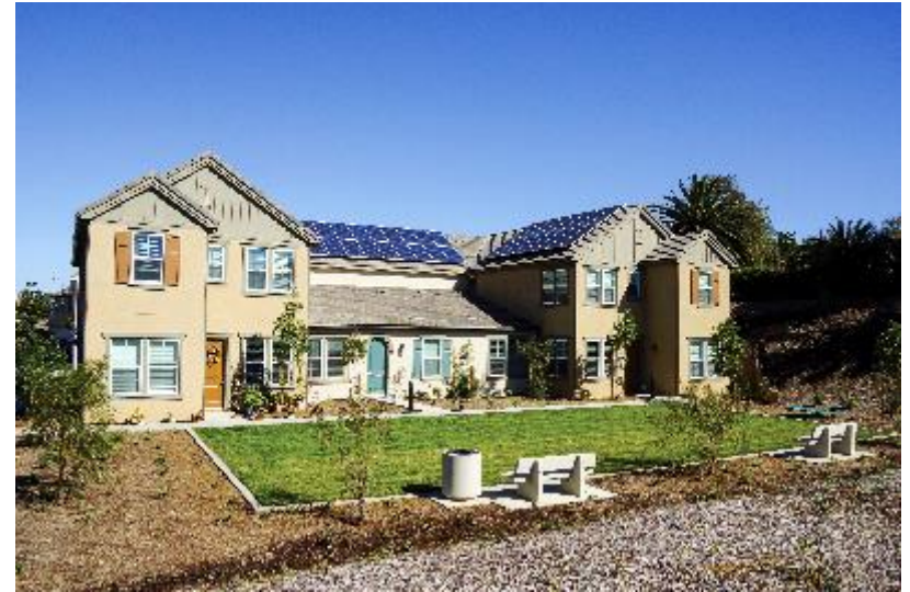
Torrey Vale 28 units for families Pacific Highlands Ranch $7 million Multifamily Housing Revenue Bonds October 11, 2016