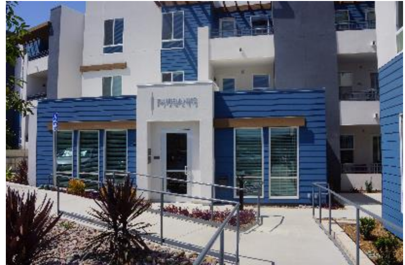
Fairbanks Terrace 82 units for seniors (age 62 and older) Black Mountain Ranch $15.3 million Multifamily Housing Revenue Bonds June 21, 2017