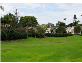
Point Loma Community

SDHC divided City of San Diego (City) ZIP Codes into three groups, each with its own payment standards: