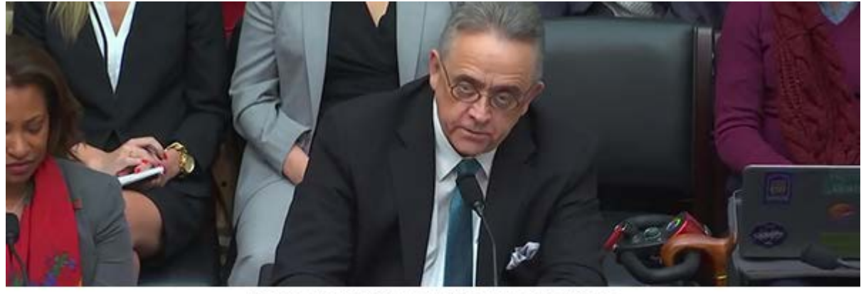
House Committee on Financial Services Subcommittee on Housing and Insurance April 25, 2018

I was among four speakers invited to testify to the U.S. House of Representatives Committee on Financial Services, Subcommittee on Housing and Insurance, at the "Hearing on HUD's Role in Rental Assistance: An Oversight and Review of Legislative Proposals on Rent Reform."