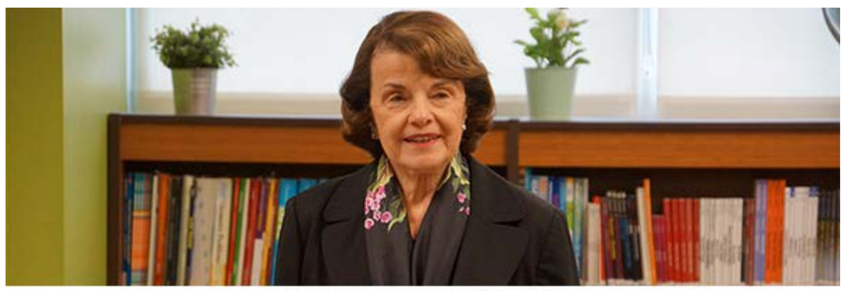
U.S. Senator Dianne Feinstein Monarch School News Conference May 1, 2018

An innovative partnership between Monarch School and SDHC that is helping families experiencing homelessness to get back on their feet was among the programs highlighted during U.S. Senator Dianne Feinstein's visit to the school yesterday afternoon.