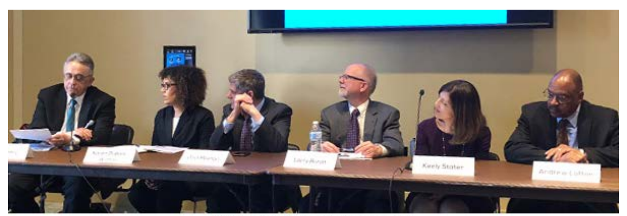
MTW Congressional Briefing Rayburn House Office Building, Washington, D.C. April 30, 2018

The MTW program's essential role in SDHC initiatives to address homelessness in the City of San Diego was the focus of my presentation at a Congressional briefing held in the Rayburn House Office Building.