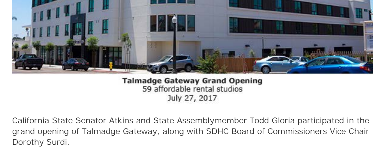
Also built with development funds awarded through HOUSING FIRST Talmadge Gateway provides 59 affordable rental studios.

grand opening as the first development in the City of San Diego at which all of the affordable units are dedicated to homeless seniors with ongoing medical needs.