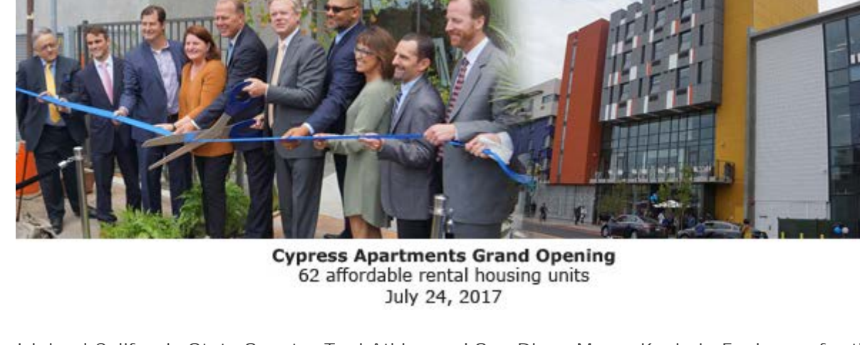
I joined California State Senator Toni Atkins and San Diego Mayor Kevin L. Faulconer for the event in Downtown San Diego s East Village neighborhood.

Cypress Apartments provides 62 new affordable rental studio apartments for chronically homeless San Diegans and homeless individuals with disabilities.