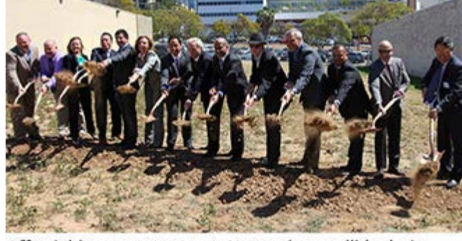
Affordable apartments at Atmosphere will include supportive housing to address homelessness.

A vacant lot in Downtown San Diego will be replaced with 202 units of affordable housing for low-income San Diegans, with the development of Atmosphere, an SDHC public-private partnership.