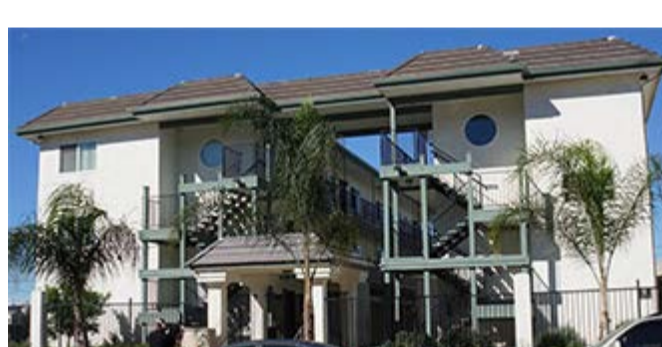
Village View Apartments, one of ten rehabilitated apartment sites.

Financial assistance from SDHC helped to complete renovations at 10 apartment sites in San Diego's City Heights neighborhood, preserving 129 apartments for low- and very low-income households for 55 years.