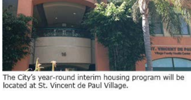
The City's year-round interim housing program will be located at St. Vincent de Paul Village.

After nearly 30 years of providing temporary tents during the winter months for homeless San Diegans, the City of San Diego in July will have year-round interim housing in a permanent facility, following the City Council's unanimous approval of a recommendation by SDHC.