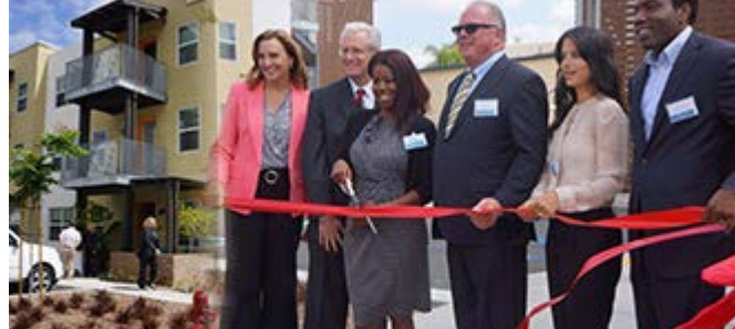
Mesa Commons 6470 El Cajon Boulevard - San Diego

SDHC Commissioner Kellee Hubbard participated in the ribbon-cutting ceremony for Mesa Commons, a 77-unit apartment complex for low-income families. SDHC was pleased to partner with Palm Communities for this development.