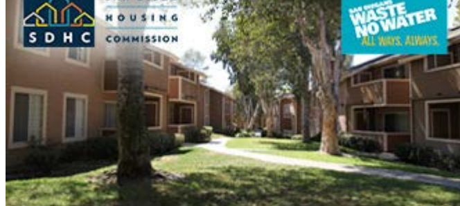
SDHC Mariner's Village Apartments "Going Gold"

SDHC also is reaching out to our more than 14,500 Housing Choice Voucher (Section 8) program participants; 5,600 landlords; 2,000 households of SDHC-owned properties; more than 300 households of properties owned by SDHC's nonprofit affiliate, Housing Development Partners; and our own 275 SDHC employees to urge them to comply with the new state law.