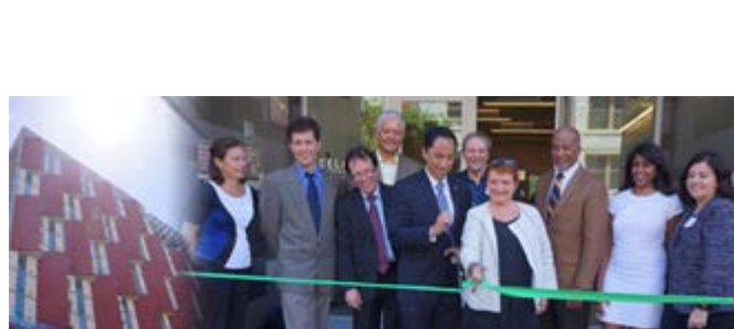
Celadon at 9th and Broadway 929 9th Avenue - Downtown San Diego

A new affordable housing development partnership in the middle of Downtown San Diego, Celadon at 9th and Broadway (Celadon), will provide 248 affordable apartments for low-income San Diegans.