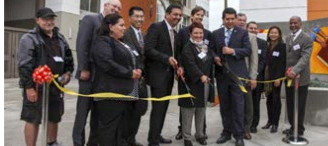
COMM22 2325 Commercial Street - San Diego

COMM22, an innovative development with housing for low-income seniors and families in the Logan Heights neighborhood, also had a grand opening.