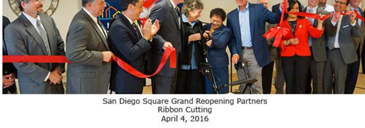
San Diego Square Grand Reopening Partners Ribbon Cutting April 4, 2016

San Diego Square will remain affordable for 65 years.