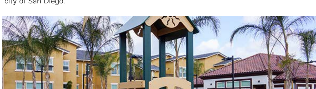
Rancho del Sol Grand Opening Amenities include: Playground, pool, computer lab, and a community room March 30, 2016

With the grand opening of the SDHC partnership development Rancho Del Sol, low-income families have a new option for housing near job opportunities in the northern part of the city of San Diego.