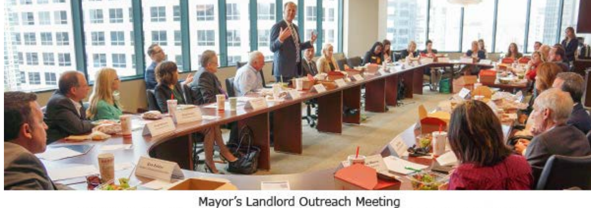
Mayor's Landlord Outreach Meeting "Housing Our Heroes" Campaign – The 1,000 Homeless Veterans Initiative April 6, 2016

I was pleased to participate in an outreach meeting with local landlords and landlord associations to encourage them to join our effort to provide housing opportunities for up to 1,000 homeless Veterans over the next year.