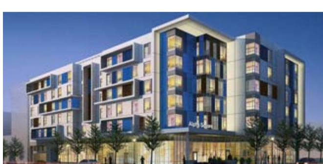
Alpha Square Affordable Apartments - Artist's rendering

Alpha Square, co-developed by Chelsea Investment Corporation and Alpha Project for the Homeless, will be a six-story building in Downtown San Diego's East Village neighborhood, and will have more than 5,400 square feet of retail space at the street level.