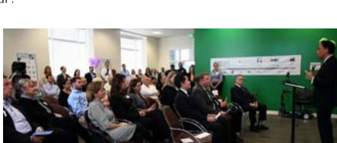
Connections Housing Downtown Anniversary Celebration on April 14, 2014.

This is exactly what SDHC and our partners in Connections Housing Downtown hoped would happen with San Diego's first-ever collaborative venture into the Housing First model for addressing homelessness a City-sponsored, one-stop housing and service center for homeless San Diegans.