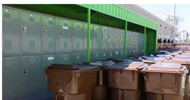
Storage Center for Homeless San Diegans 252 16th Street Downtown San Diego

Unveiled at a ribbon-cutting ceremony, the new lockers, in combination with the remaining on-site storage bins, will enable the TSC to serve more than 400 homeless individuals.