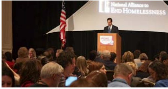
HUD Secretary Julian Castro at the 2015 National Conference on Ending Family and Youth Homelessness

"We must never accept homelessness as part of American life, and if we all do our part, we'll never have to," Secretary Castro said at the conference. ( Watch the video. )