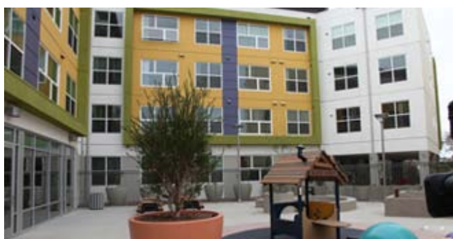
COMM22 Senior apartments with children's playground