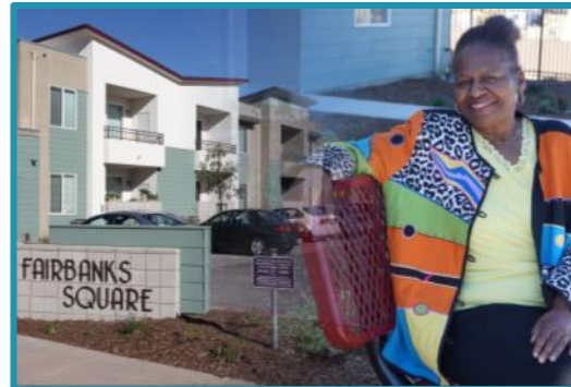
Creating Affordable Housing