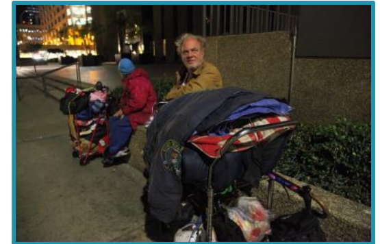
Solutions To Homelessness