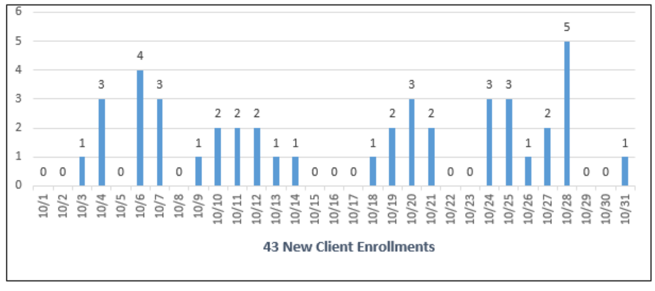
Table One: New Client Enrollments October 2022

The tables below provide an overview of data for SCCI in October 2022. SCCI enrolled 43 new clients and served 510 total clients throughout the month of October. Of the 510 clients served, 441 of them returned to SCCI to access their storage bins, and the total number of return check-ins in October was 2,714. Fifty-three clients exited SCCI in October.