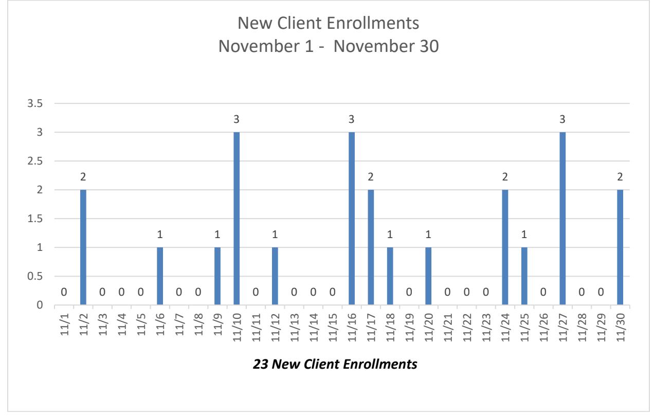
Table Two: New Client Enrollments November 2020