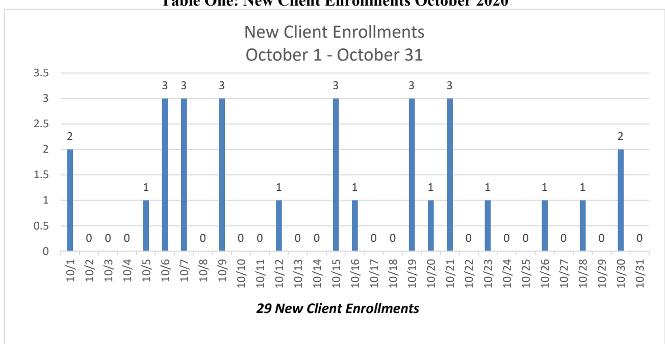
Table One: New Client Enrollments October 2020