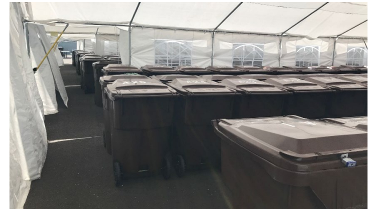
The Center II