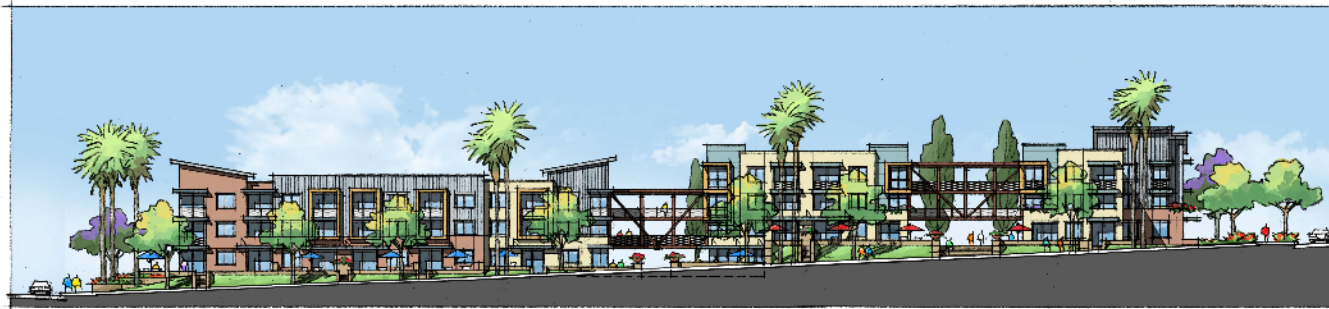
URBAN CORRIDOR STREET (EAST)