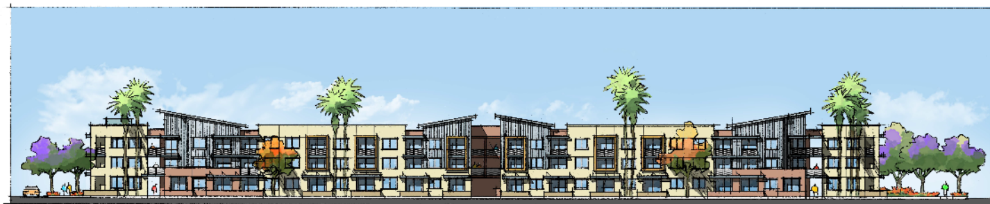
VILLAGE ENTRY DRIVE

Bassenian Lagoni ARCHITECTURE • PLANNING • INTERIORS