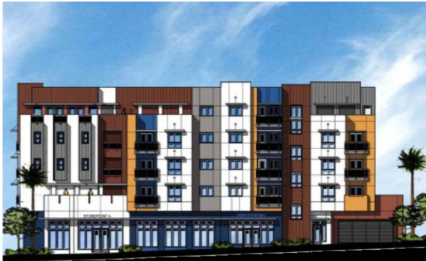
Kingdom Development & MAAC's Ventana al Sur