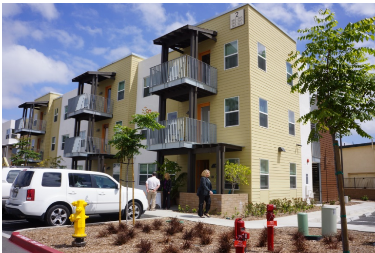
Mesa Commons – SDHC Partnership College Area, City Council District 9 77 affordable apartments and one manager’s unit Completed: January 22, 2015