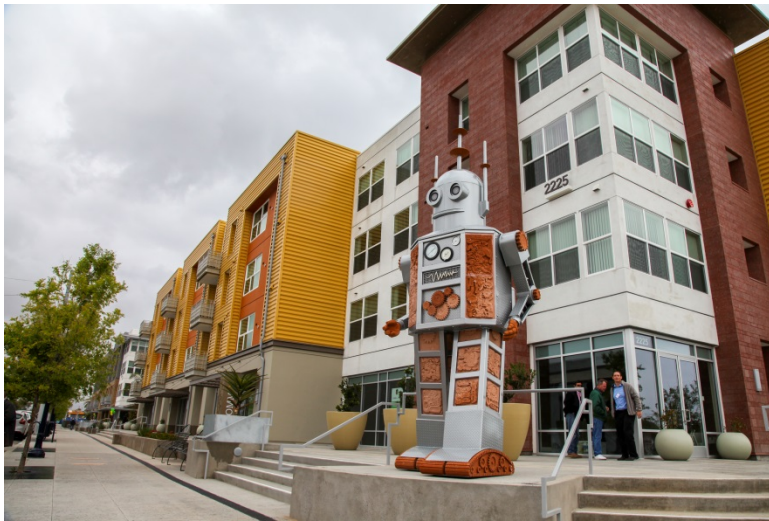
Paseo at COMM22 – San Diego Housing Commission (SDHC) Partnership Logan Heights, City Council District 8 128 affordable housing units and two manager’s units Completed: December 31, 2014

Fiscal Year 2015 (July 1, 2014 – June 30, 2015)