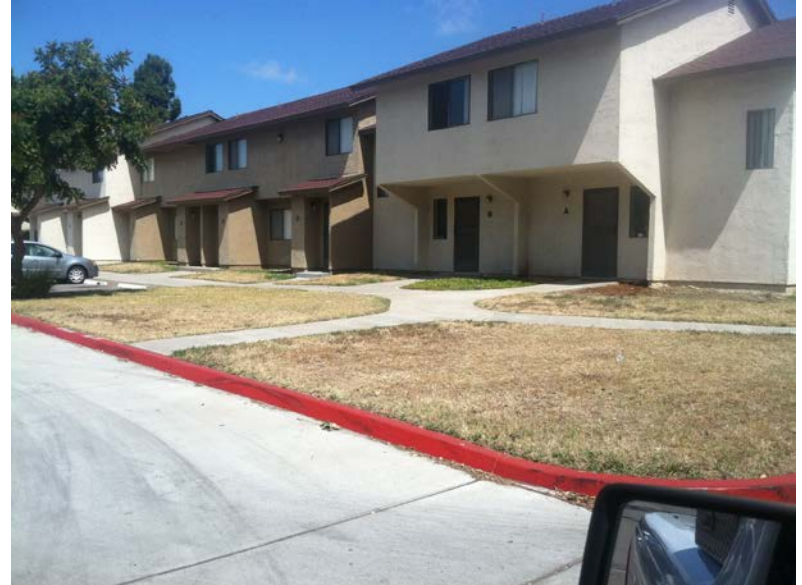
178 – 190 Calle Primera San Diego, CA 92173