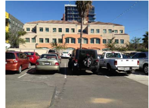
Proposed new Day Center site St. Vincent de Paul Village campus 1402 Commercial Street Downtown San Diego