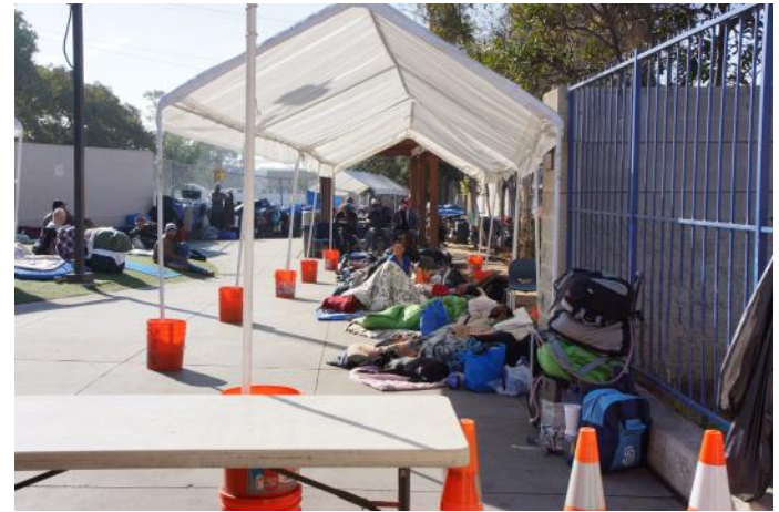
Neil Good Day Center 299 17 th Street Downtown San Diego