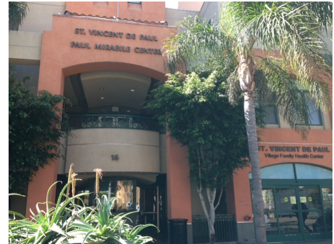
Paul Mirabile Center St. Vincent de Paul Village campus 16 15 th Street Downtown San Diego