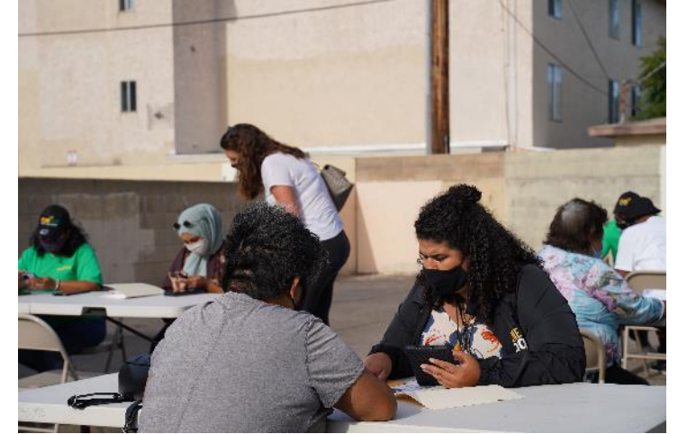
Application Assistance and Outreach SDG&E and San Diego & Imperial Counties Labor Council May 28, 2021