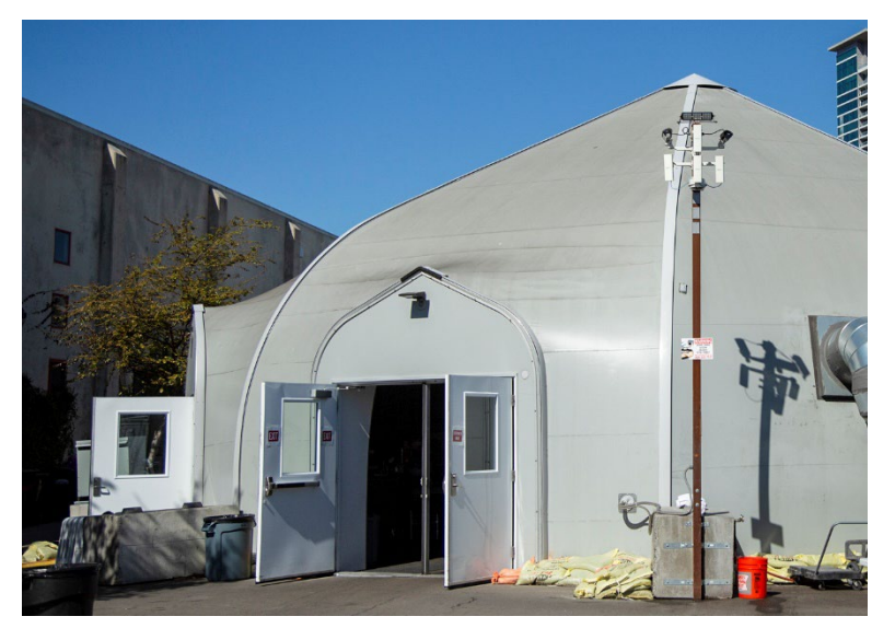
City of San Diego Bridge Shelter 1501 Newton Avenue February 22, 2019