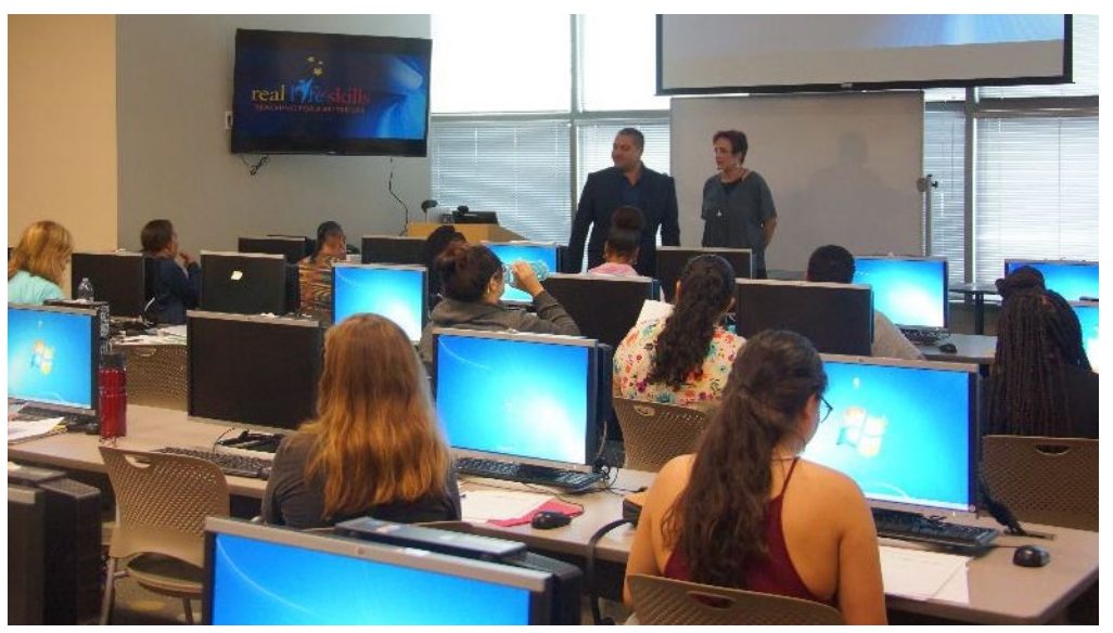
Real Life Skills Workshop – August 12, 2019