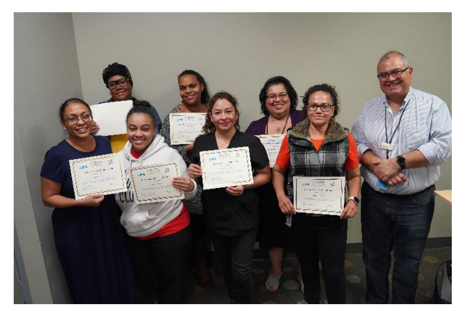
Positive Parenting – December 18, 2019