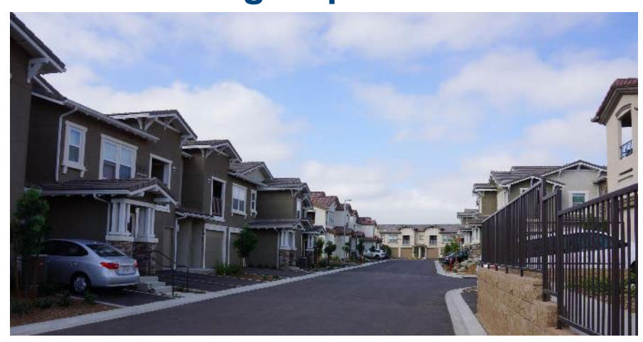
Cielo Carmel – Del Mar Heights 195 Affordable Units (Choice Community)