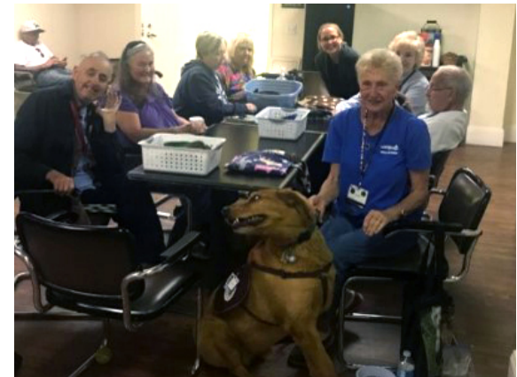
Resident Services at Hotel Sandford