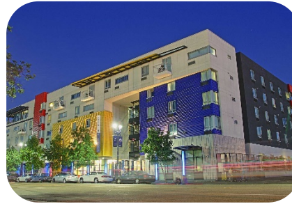
Single-Room Occupancy (SRO)