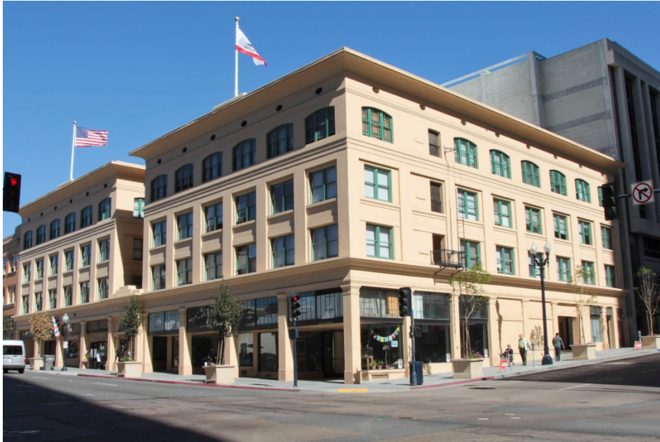
Hotel Sandford 1301 Fifth Avenue Downtown San Diego 129 affordable rental units