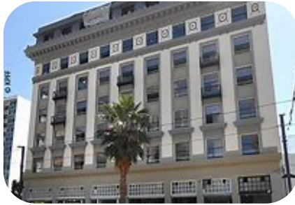
Permanent Supportive Housing