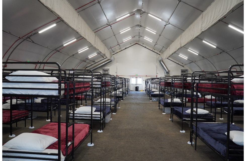
City Bridge Shelter 1710 Imperial Avenue 139 Beds Operator: Alpha Project