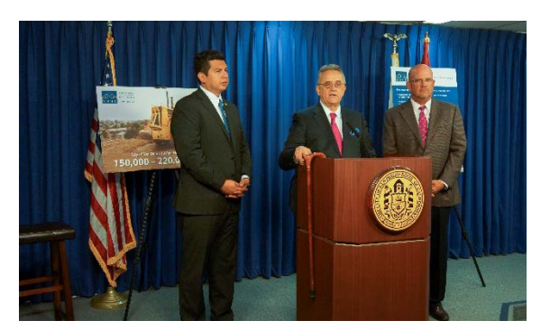
SDHC Housing Production Objectives Report News Conference – September 21, 2017

The City of San Diego can create enough additional housing to meet its need if the majority of the proposals in this report are implemented.